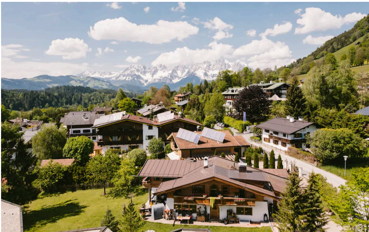
Kitzbühel – 'your classic Alpine resort'

Insider tip: Book a sunrise breakfast trip up the 1,996m Kitzbüheler Horn, which includes traditional brass music and a spread of farmhouse bread, fresh butter and local cheeses.