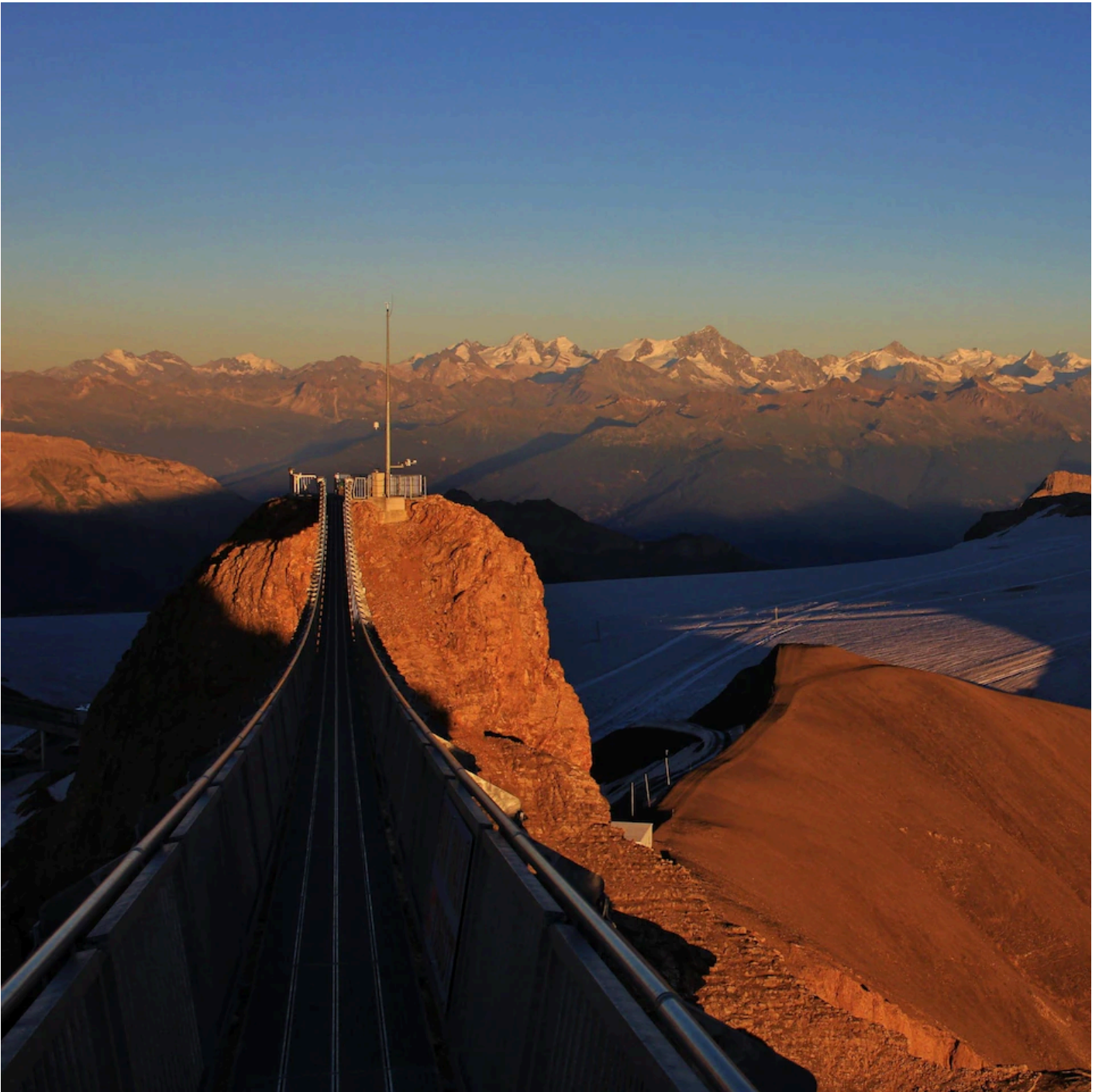
The view from the Glacier 3000 cable car

Alternatively, test your nerve on the vertiginous Peak Walk, the world's first suspension footbridge between two summits. Settle your nerves afterwards at Glacier 3000's restaurant – reopening this summer following a fire in 2022, it's been redesigned by Swiss architect Mario Botta, with a new panoramic terrace.