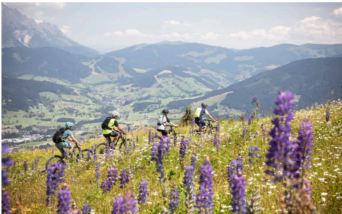
Austria's largest bike area has over 90km of trails

Lonely Planet named Saalfelden Leogang one of the ten best travel regions in the world for 2024, on account of its strides towards sustainability and its glut of guided Alpine activities. This Salzburgerland resort is Austria's largest bike area, with over 90km of trails, and a network of lifts and cable cars to take you to them.