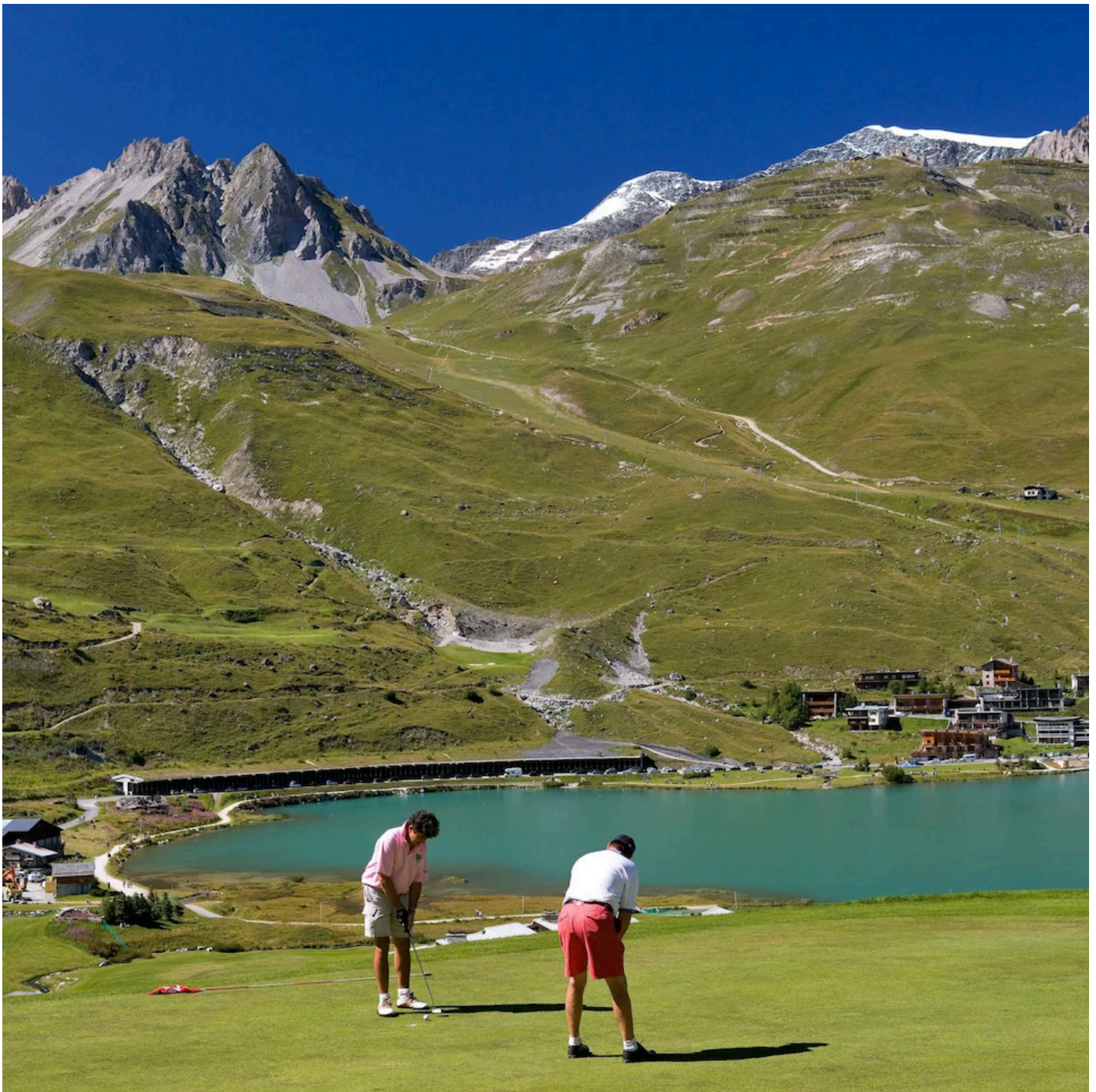
Tignes: play 'the highest golf in Europe'

Tignes bills itself as THE sport and activity resort in the French Alps, with some justification. An official “Terre des Jeux 2024” – a Paris Olympics training camp for various disciplines – it’s geared to outdoor exertions. You can do everything here, from cycling, hiking, trail running and rafting, to kayaking, biathlon, water sports and beach volleyball.