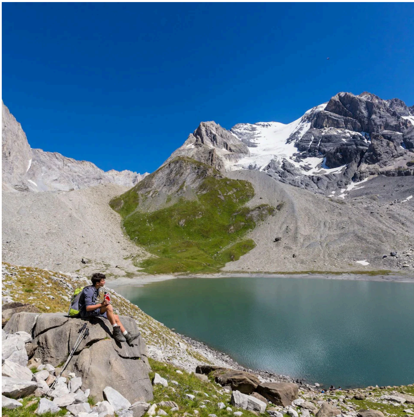
Explore the glaciers and lakes of Pralognan

Although the local population is just 738, there are 35 hiking and mountain guides here ( guides-pralognan.com ). New excursions for 2024 include an icy glacier trip, a hiking tour to the wildest peaks, and à la carte journeys, ranging from two to eight days, sleeping in mountain huts. Of course, you can hit the 250km of hiking trails alone; there are also chances to try climbing, paragliding, mountain-biking, trail running, via ferrata and more.