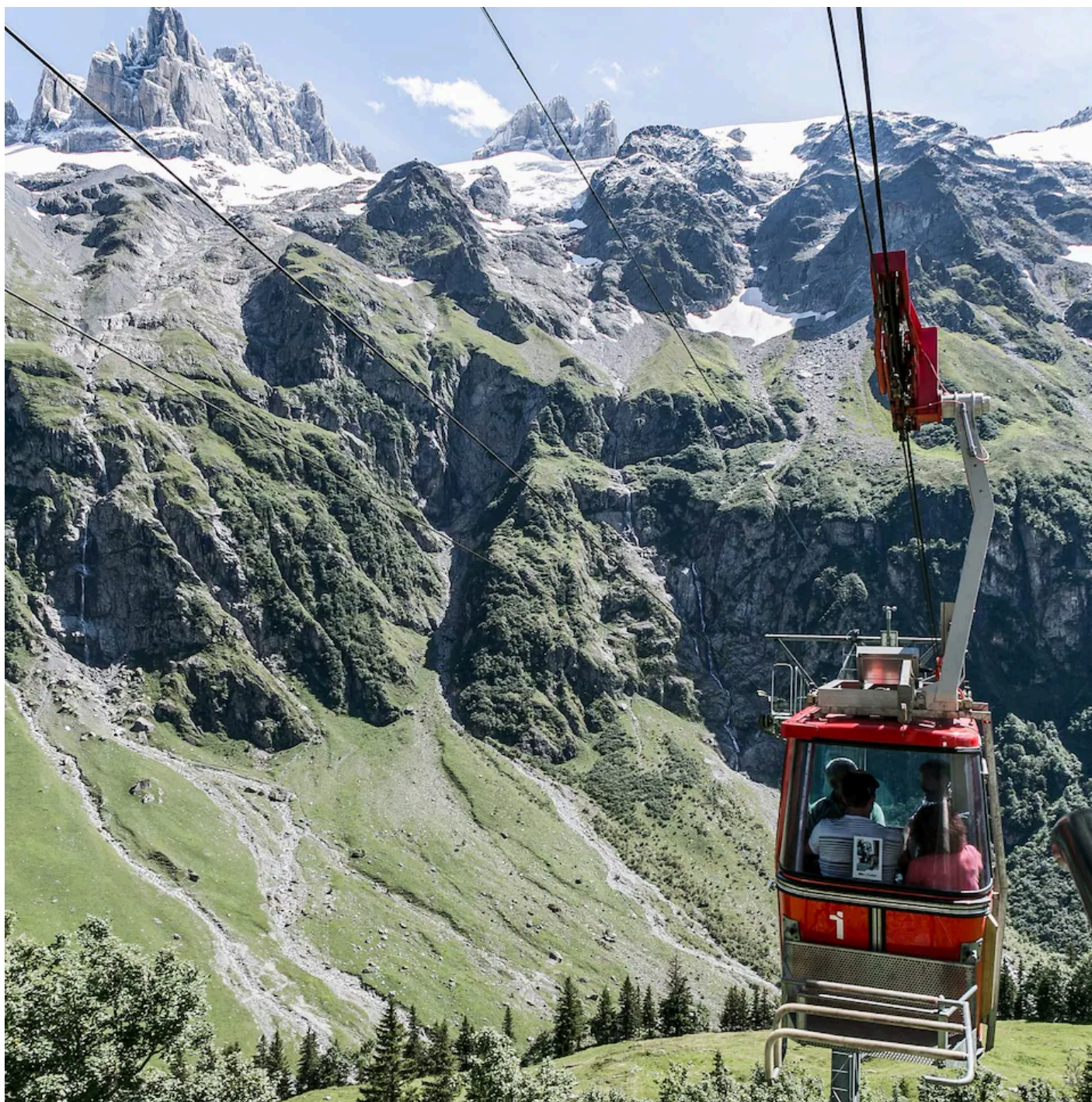
The Titlis cablecar

Despite being the largest holiday resort in the region, with a distinctly sporty vibe, it's charming too, thanks to its belle époque buildings and Benedictine monastery, founded here in 1120 – explore it on a guided tour or join a cheese-making session in the monastery dairy ( chaes-im-kloster.ch ). This summer, Engelberg has an additional cultural attraction: Backstage Engelberg (June 21-August 18 2024) will see 40 artists exhibiting in usually private, empty and unseen spaces to create a unique art trail.