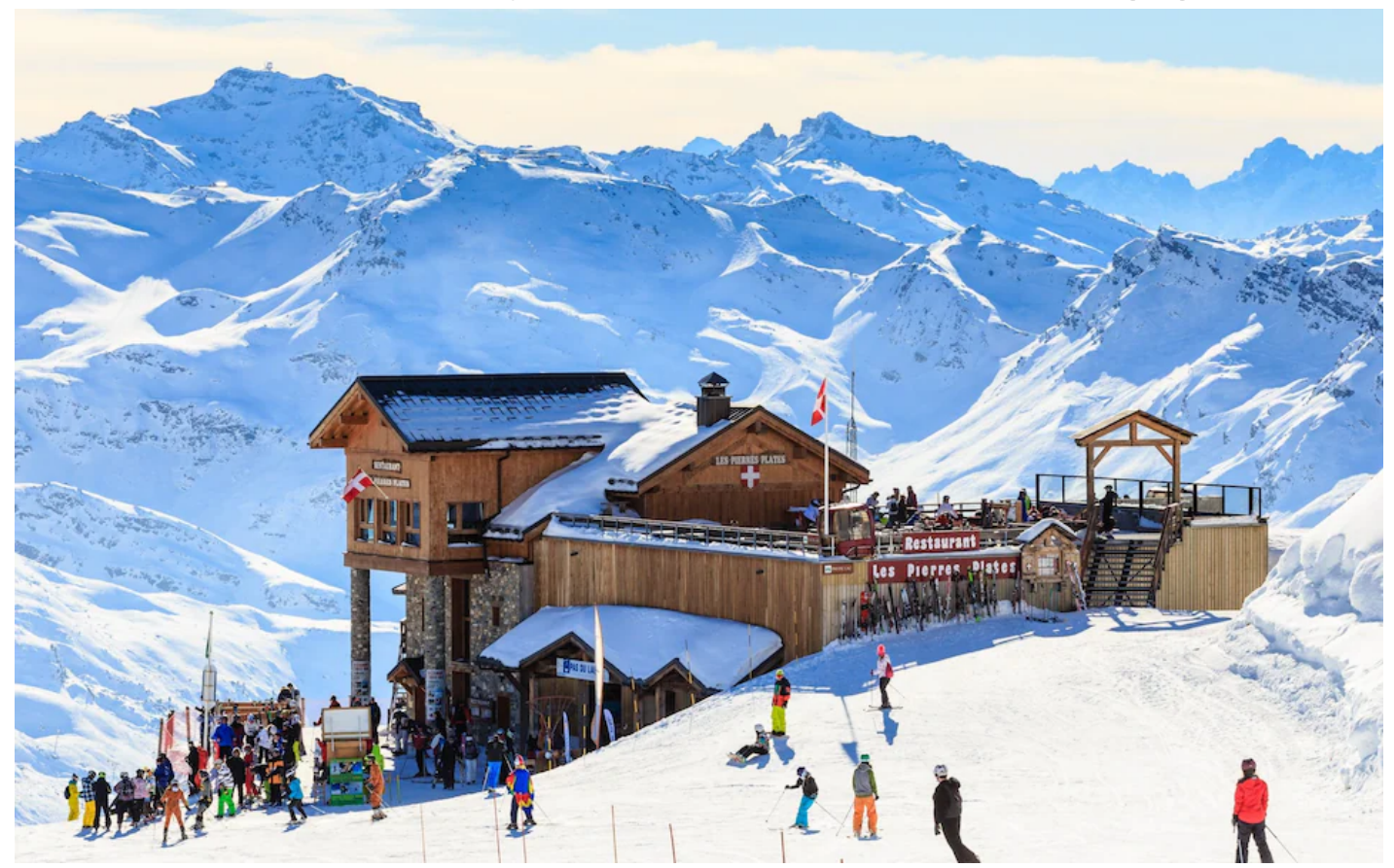
'Peak Retreats has defended its position as champion in this category,' writes Aspden-Kean

Over the course of the past three winters, ski operators have endured a seemingly endless storm. The winners of this year's awards showcased stellar commitment to delivering memorable, and valuable, holidays in the mountains – despite the challenging conditions.