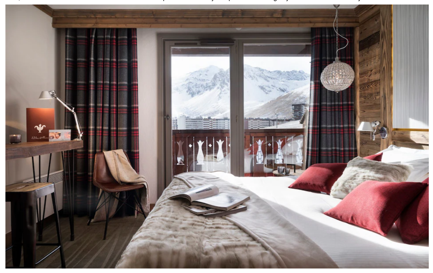
The appetite for value breaks is still strong, demonstrated by Sunweb's third-place ranking

Holidaymakers' desire to see their money go further on the slopes extends to the operator's portfolio of destinations. Branching beyond the familiarity (and high prices) of the Alps to the likes of Andorra and Scandinavia is a promising sign of British skier's appetite to travel off the beaten track and explore – if the price is right, and the snow is ample.