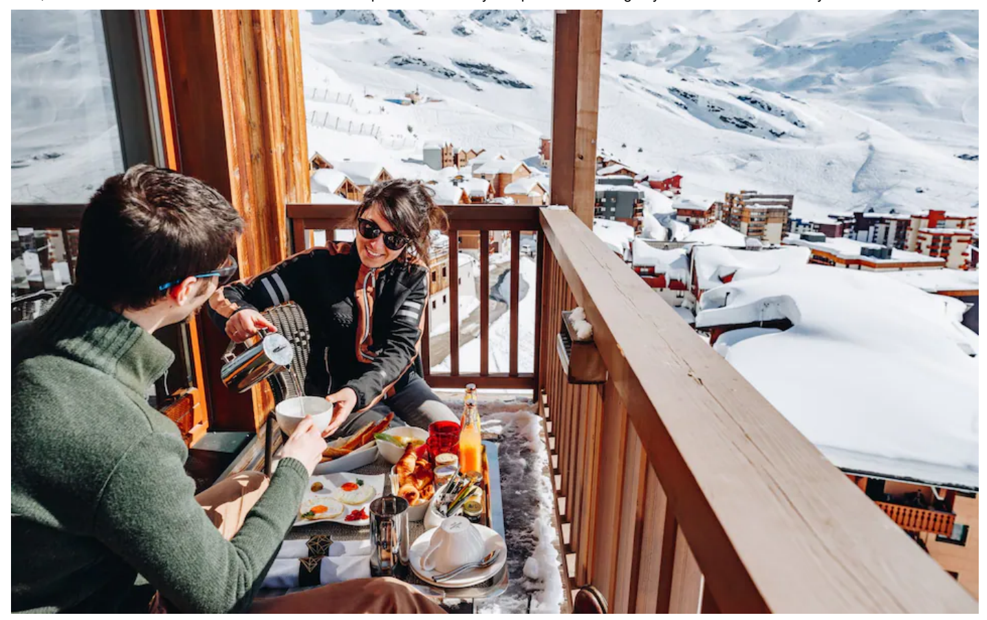
VIP Ski remains on the podium, rising from the third spot in 2019

Not that it hasn't rethought its approach. With founder Andy Sturt at the helm, VIP has remodelled its classic chalet break, to include flexible travel options and complimentary ski guiding, and opened a <u>new flagship property, Bear Lodge, in Arc 1950</u>. The new lodge was seven years in the making as the company has shifted its focus to only the most snow-sure French resorts, above 1,500m. VIP Ski's continued presence as one of your favourite operators shows the longevity of chalet holidays and their importance to British skiers.