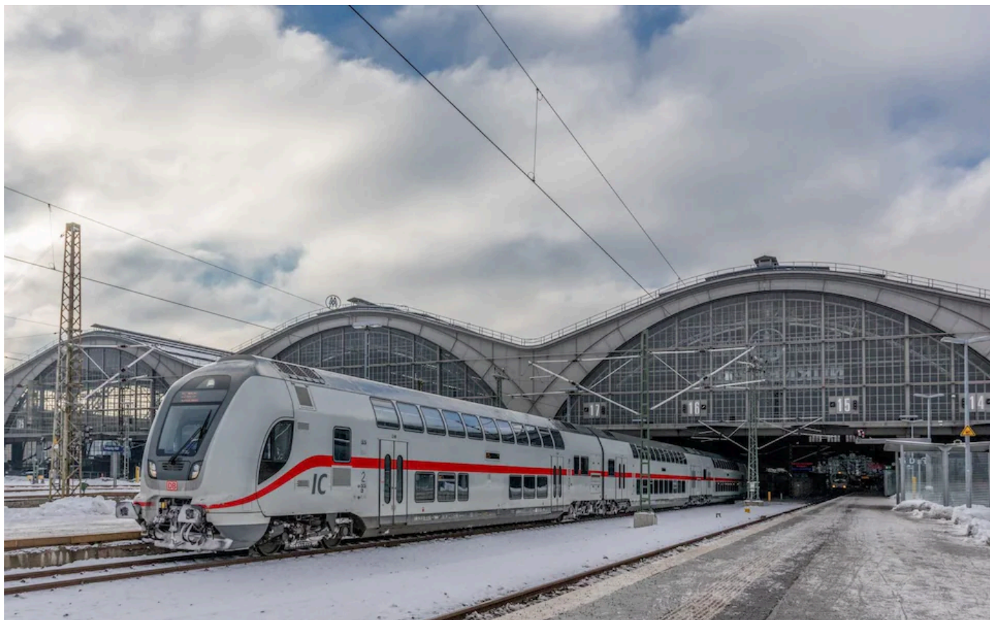
Beyond France rail options include sleepers and fast trains