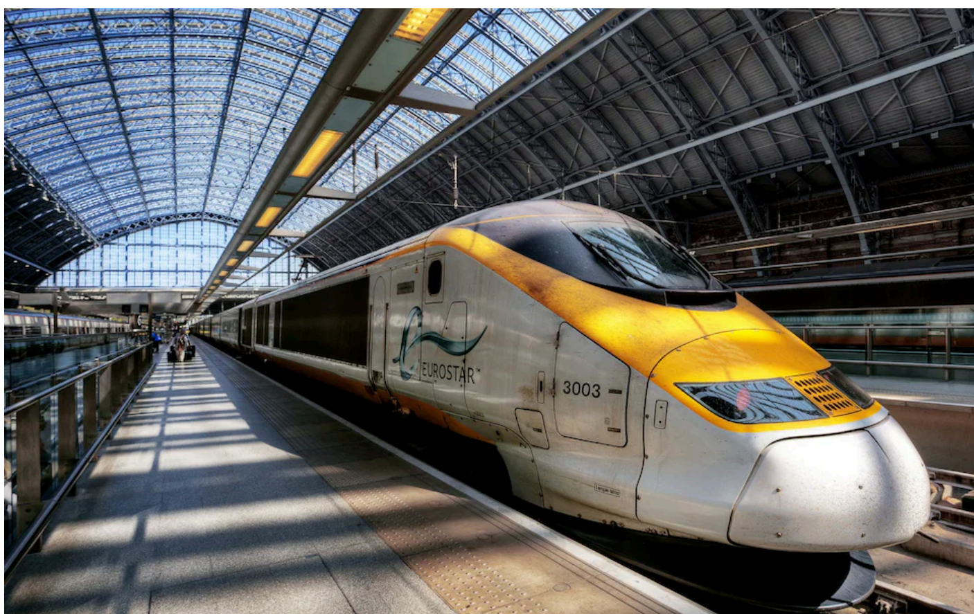
Train journeys to the Alps begin in London St Pancras

There are 347 seats for skiers on the service, up from the 250 available last season. Yet it's still a paltry amount compared to the 900 seats on each of the two Eurostar Ski Trains that used to run.