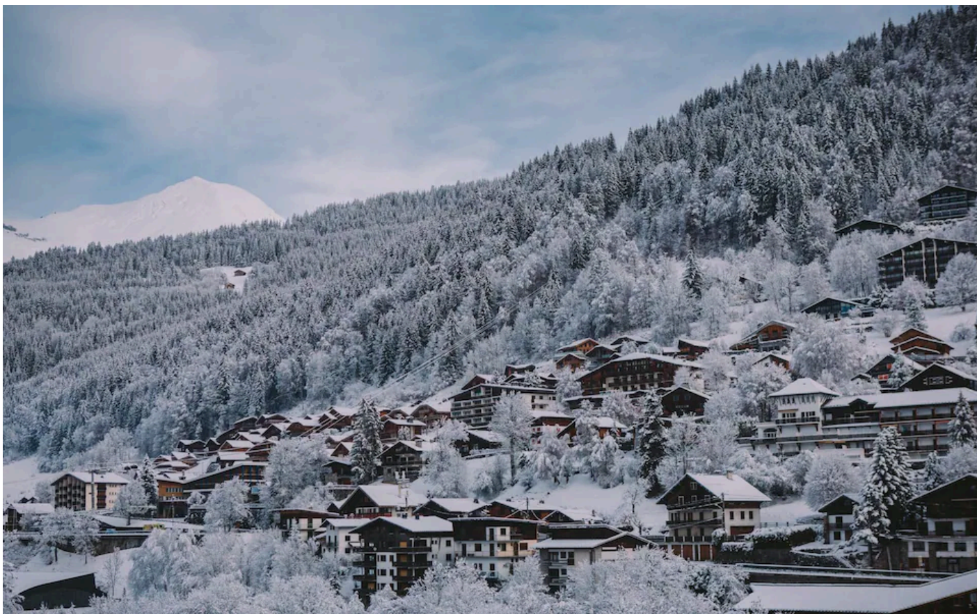
Morzine encourages visitors to arrive by train