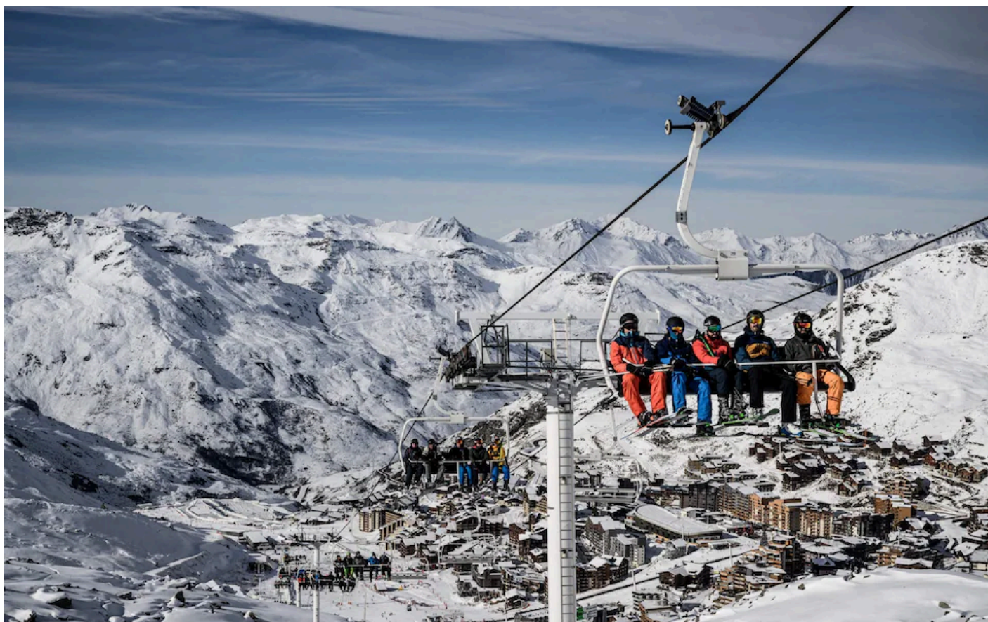
It's possible to reach Val Thorens, Europe's highest ski resort, by train

Snowfinders offers eight nights at the Les Temples de Soleil, Val Thorens, in a one-bed apartment, from £933 per person, based on four sharing, including return train travel, lift pass, accommodation and transfers.