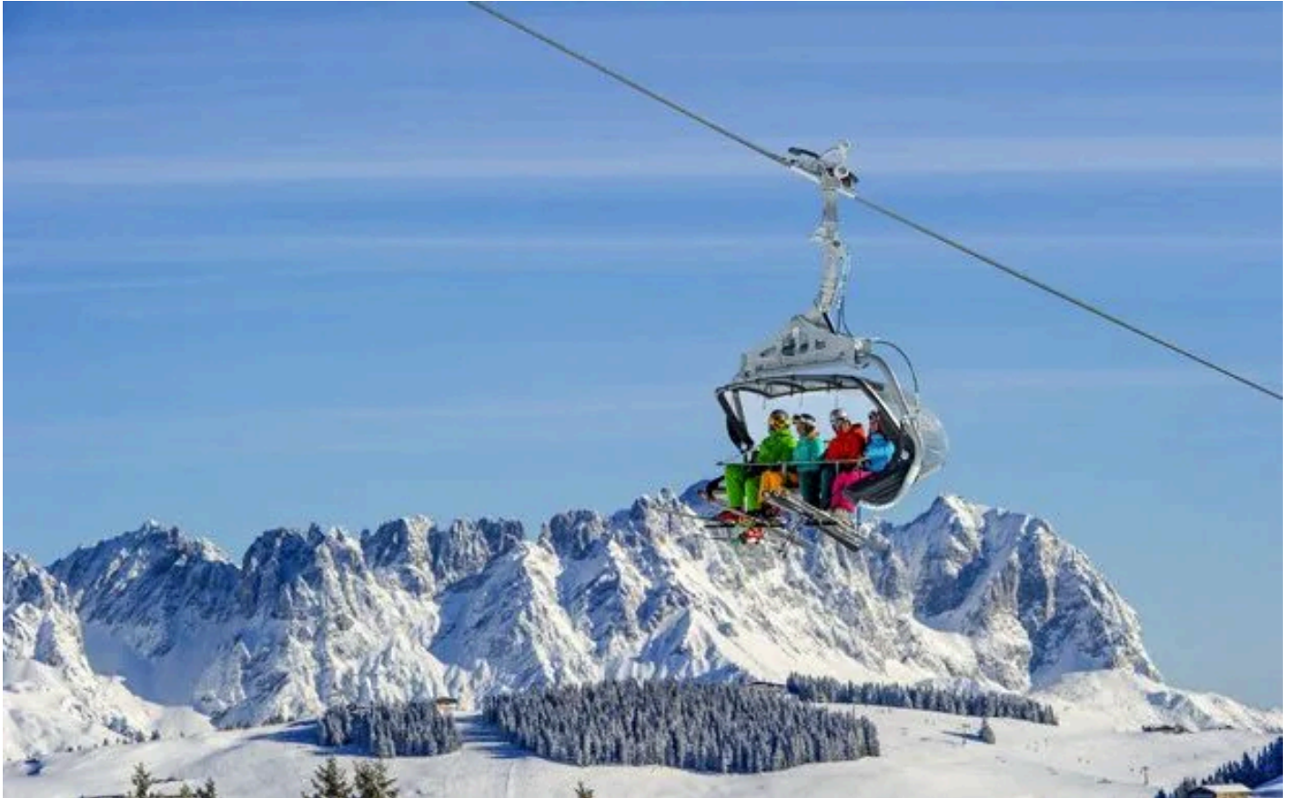
Söll forms part of the SkiWelt region

Return rail fares from £202 per adult booked through The Travel Bureau ( thetravelbureau.co.uk ).