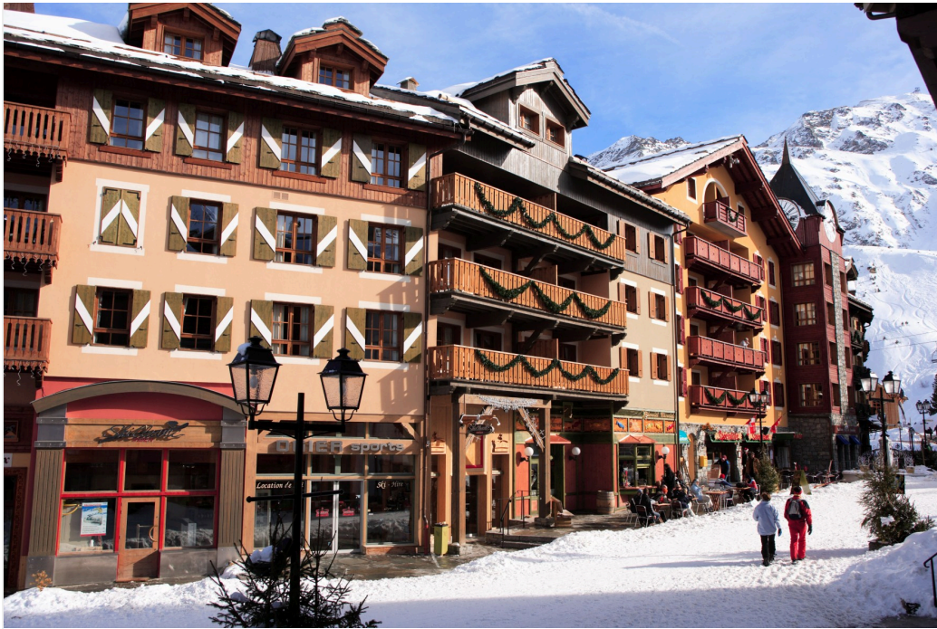
Arc 1950 village