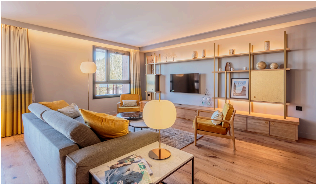
Les Cristaux apartment by Peak Retreats

Peak Retreats has a choice of self-catering apartments, and prices include return Flexiplus fares on LeShuttle from Folkestone, so you can board the next available train when you arrive at the terminal. The Edenarc aparthotel in Arc 1800 includes access to a spa area with an outdoor heated pool, sauna, steam room and hot tub. If you want to ease your cooking and washing-up burden, order in from Huski, a sort of posh Deliveroo, which tailors menus to your requirements (from £51 for two; hu.ski). So long as you are not too heavy on the right foot, a return drive to the Alps from either the Eurotunnel or ferry port in Calais should not cost much more than about £300 in fuel and motorway tolls. The ViaMichelin app returns an estimate of £146 each way, but it will depend on your car and how carefully you drive (viamichelin.co.uk). Details Seven nights' self-catering for two from £898pp, including LeShuttle but excluding petrol and tolls, departing on March 16 (peakretreats.co.uk)