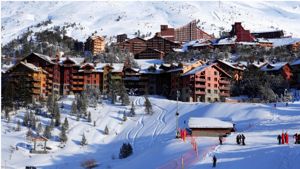
Les Arcs in the Alps

It's possible to stay in a premium French resort on a budget — without the hassle of flying. Here's how