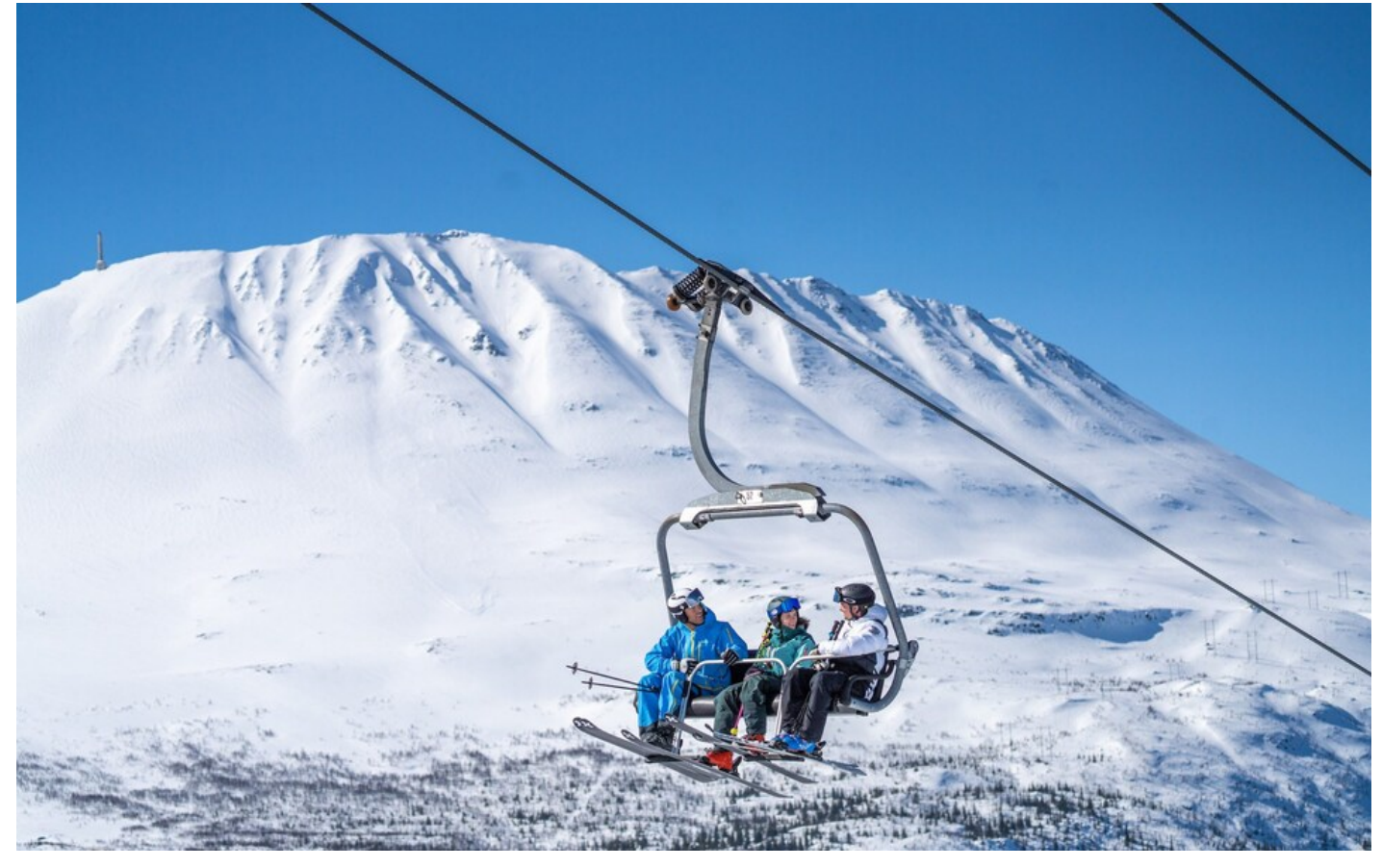
Off-the-beaten-track specialist Ski Safari is launching in Norway at the resort of Gausta