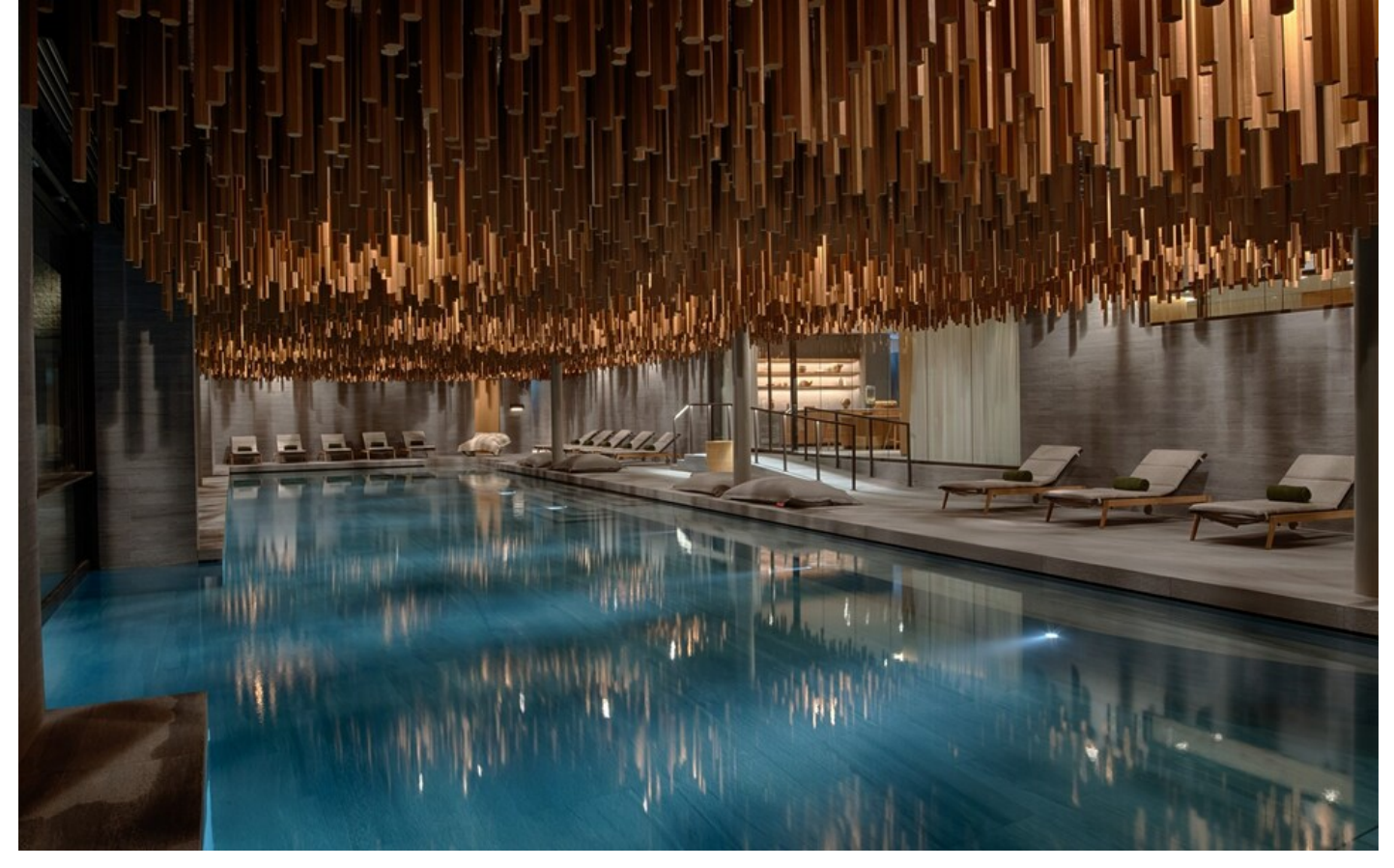
Push the boat out with a stay at the new Six Senses Crans-Montana