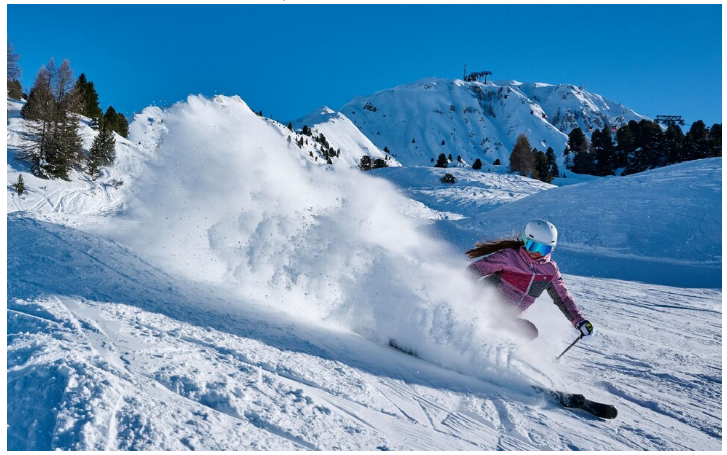
La Plagne in France is set to be popular this season

It's also when resorts, operators and experts share their biggest news and exciting developments for the winter ahead. From money-saving tricks to discovering under-the-radar resorts, now is the time to do your research.