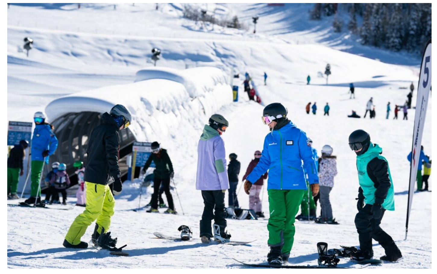
Steamboat is on track to become the the second largest resort in Colorado

Snow reports and top resorts - how to plan the ultimate ski holiday this season