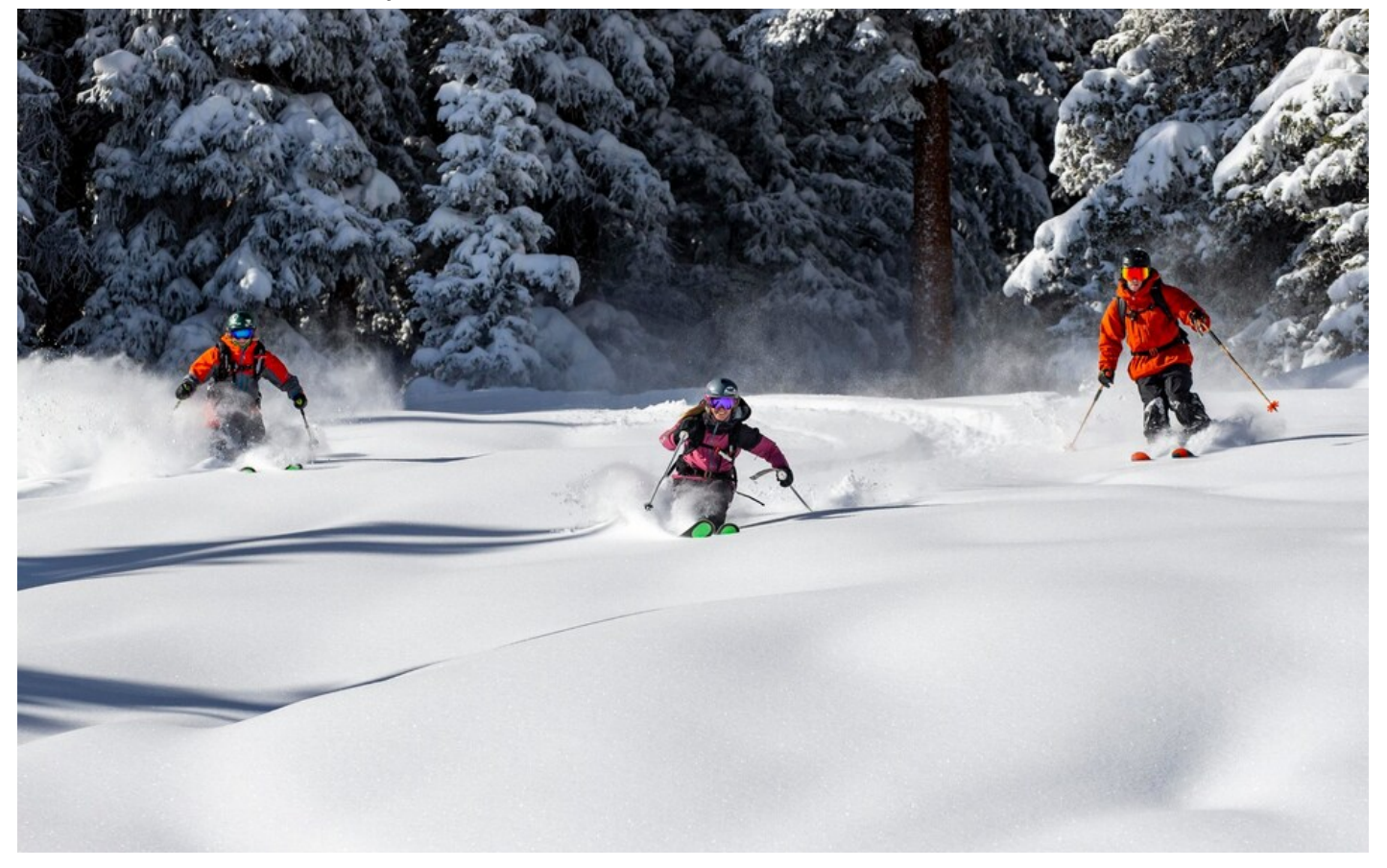
For a successful ski holiday, look for ski areas with plenty of high terrain

this winter. The main clues will come by mid-November, when forecasters will be hoping for more sustained wintry conditions.